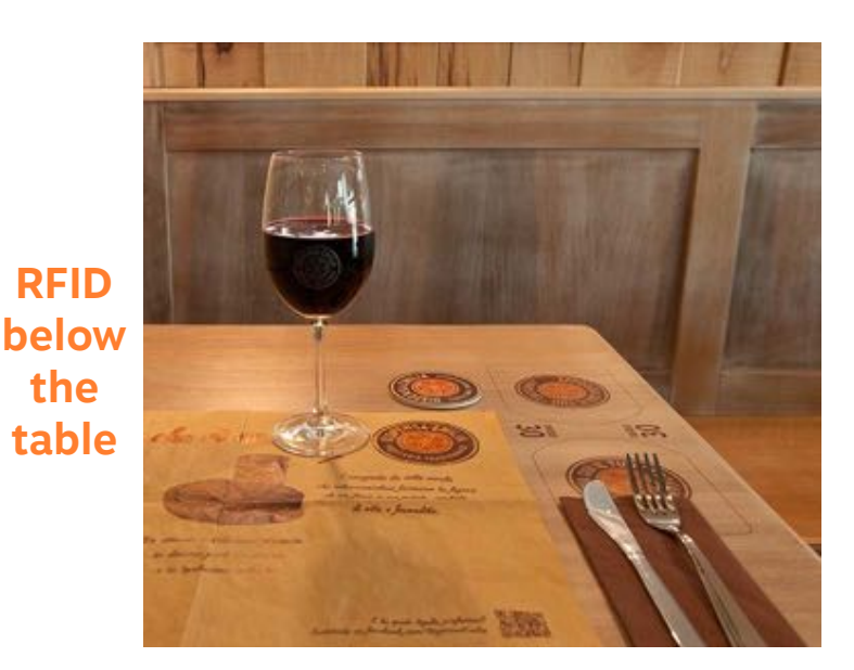
Painted marks on a wooden table Dispensa Emilia, Modena, Italy