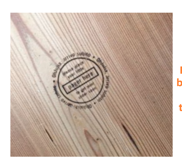
Burning mark on a wooden table Oh Julia, Munich, Germany