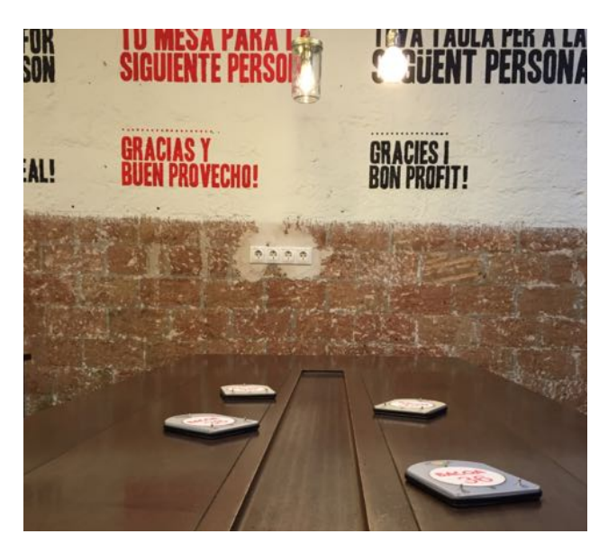
All-over lamination below a wooden table BACOA , Barcelona , Spain

If you want to stick the tags on the top, we recommend you a special label to protect the tag against vandalism.