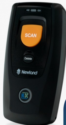
BS80 Piranha II 1D Handheld Scanners